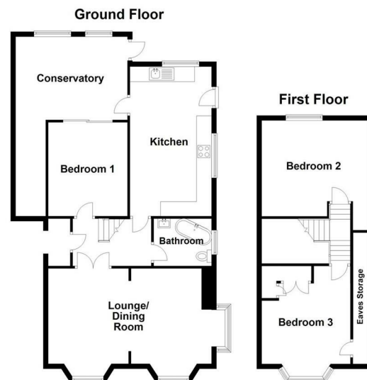
Not to scale. For illustrative purposes only